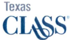
Exhibit D – Participation Certificate

The undersigned COUNTY OF NAVARRO (the Local Government) does hereby request that it be admitted as a Participant pursuant to Section 2.3 of the Ninth Amended and Restated Trust Agreement (the Agreement) dated as of February 25, 2021, by and between the Participants, UMB Bank as Custodian, and Public Trust Advisors, LLC. By executing this Participation Certificate, the undersigned agrees that, upon the execution hereof by the Program Administrator, it will become subject to the same obligations and shall have the same rights as if it had executed the Agreement.